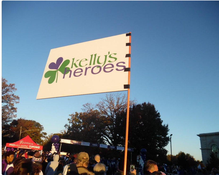
Kelly's Heroes 2017